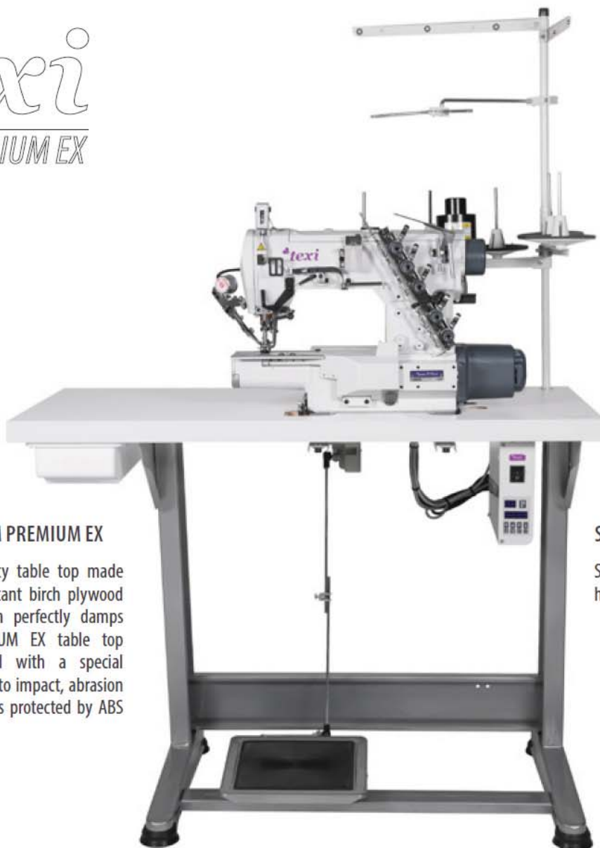
TABLE TOP TTCM PREMIUM EX

The highest quality table top made of moisture resistant birch plywood (30 layer) which perfectly damps vibrations. PREMIUM EX table top surface is coated with a special laminate resistant to impact, abrasion and splinters. Sides protected by ABS slats.