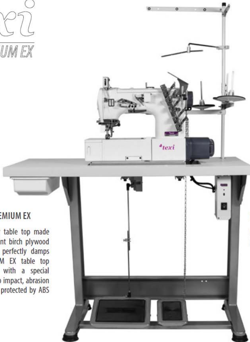
TABLE TOP TT PREMIUM EX

The highest quality table top made of moisture resistant birch plywood (30 layer) which perfectly damps vibrations. PREMIUM EX table top surface is coated with a special laminate resistant to impact, abrasion and splinters. Sides protected by ABS slats.